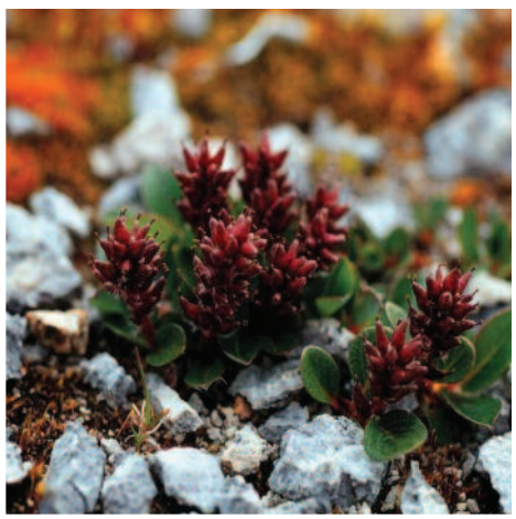
Barrens Willow, Endangered