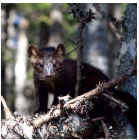
Newfoundland Marten, Threatened