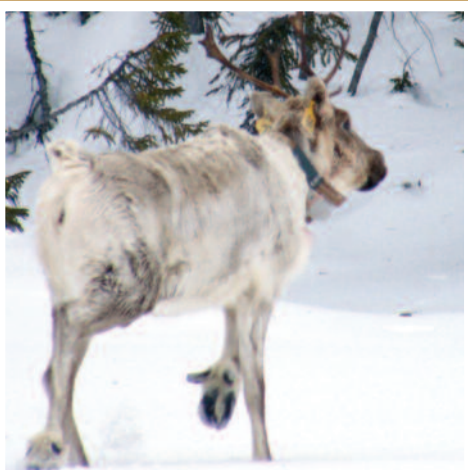
Woodland Caribou, Threatened

The Province supports, as a guiding principle, that all species have the right to exist, therefore no species should become extinct or extirpated owing to human actions.